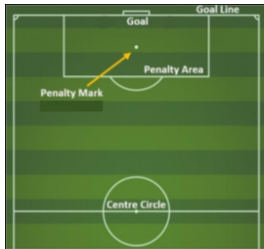
Figure 2. Diagram of Penalty Area

The penalty mark is only needed for U11-U13 age groups and is 9 m from the goal line. Cones must not be used to indicate the penalty mark.