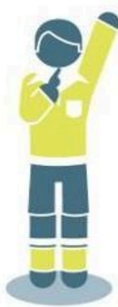
Indirect free kick