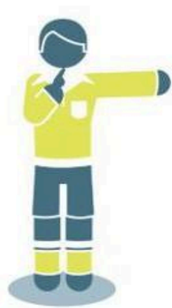
Direct free kick